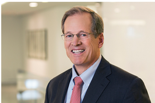
Jack Kingston (R-GA) Former US Representative and House Committee on Appropriations Member Principal, Squire Patton Boggs

“The House has only passed one appropriations bill. The Senate hasn’t passed any. The chambers are divided on spending levels and the underlying philosophy, so the possibility of a shutdown is high.”