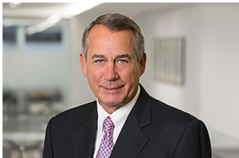
John Boehner (R-OH) Former Speaker of the House Senior Strategic Advisor, Squire Patton Boggs

“Congress and the president have a lot on their plate this fall, from the farm bill and FAA reauthorization to the national defense bill and the appropriations bills that keep the government running — not to mention a lot of unfinished business on topics such as energy permitting, tax extenders, and cannabis banking. Many of these tasks are the basic responsibility of governing — and one way or another, our elected leaders will find a way to get them done. But the process of getting there could be wild and unpredictable, especially in a time of divided government as America begins to look toward the 2024 election. If you have a stake in what happens this autumn in terms of federal policy, you might want to buckle up.”