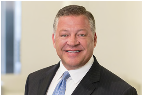
Bill Shuster (R-PA) Former US Representative and House Committee on Transportation and Infrastructure Chair Senior Policy Advisor, Squire Patton Boggs

“The legislative branch of our federal government is responsible not just for working with the president to make law, but also for overseeing the administration and implementation of law through the oversight process. Congressional committees do the bulk of the work on both fronts — legislation and oversight. And in the current Congress, particularly in the Republican-led House, we’re seeing many committees place an increasing emphasis on the latter. That trend is likely to continue in the months ahead as the pressures of divided government come to a head and the window for bipartisan legislating begins to narrow. But there will still be a need and a place for moving legislation in key areas where consensus is possible, and the committees will continue to drive much of that work.”